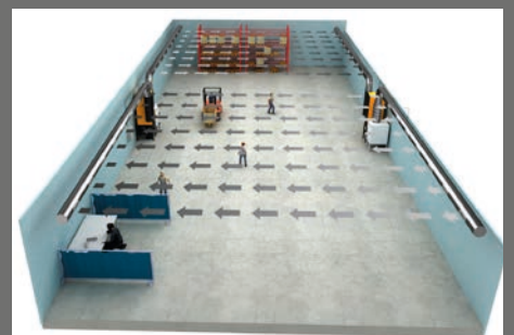
Parallel Push-Pull System with 2 filter units and 2 fans