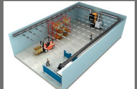
U-shaped Push-Pull System with 1 filter unit and 1 fan

Plymovent offers a variety of high quality products geared towards protecting workers from airborne contaminants. To find out which system is right for your needs, please contact Plymovent or visit our website, www.plymovent.com .