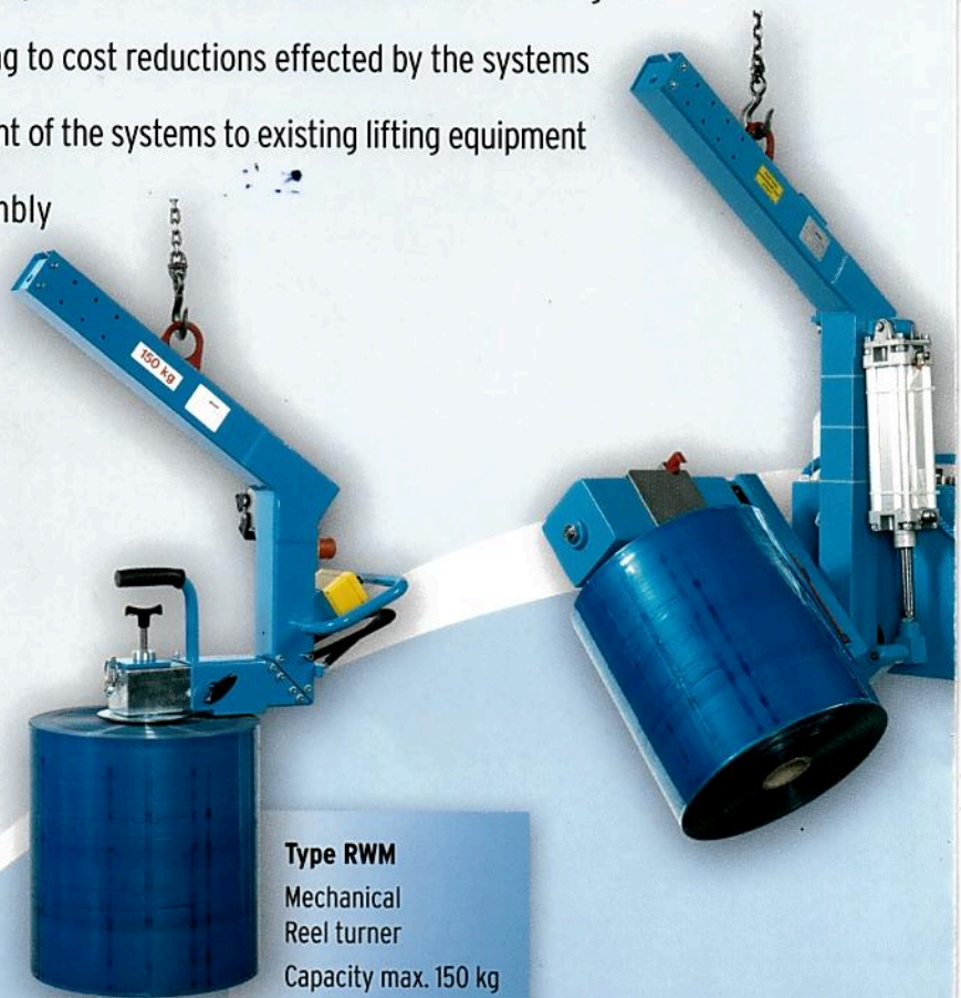
Type RWM Mechanical Reel turner Capacity max. 150 kg