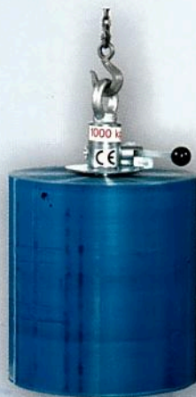
Type RH Mechanical Reel lifter Capacity max. 2,000 kg