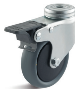
1-DSN (bolt hole+ double brake)

Matching accessories can be found on page 432