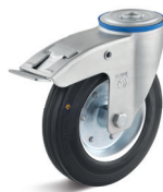
1-DSN (bolt hole+ double brake)

Matching accessories can be found on page 432