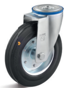
-1 (bolt hole)