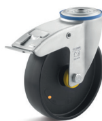
1-DSN (bolt hole+ double brake)

Matching accessories can be found on page 432