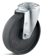
-1 (bolt hole)