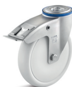
1-DSN (bolt hole+ double brake)

Matching accessories can be found on page 432