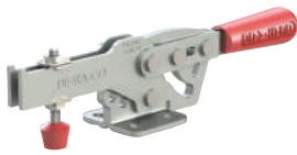
2017-U Flanged Base U-Bar