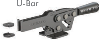
2017-U-LS-BLK ⓘ Blackout Series Flanged Base U-Bar