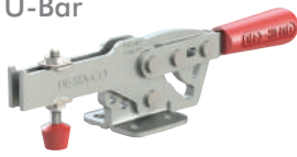
2017-U Flanged Base U-Bar