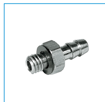
Straight Fittings - Barb Style Connection