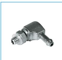
Angled Fittings - Barb Style Connection