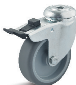
1-DSN (bolt hole+ double brake)